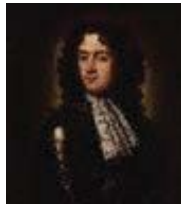
James Duke of Monmouth

Was the rebellion a total and bloody failure, and the lives thrown tragically away? The answer lies in 300 years of unbroken Protestantism in Britain after that event.