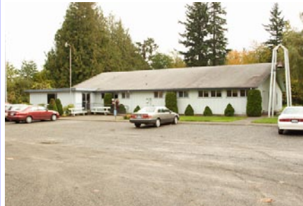
Covenant Grace Reformed Church, Lynden, Washington (Independent)

FOR CONVENIENCE IN MAILING YOUR DONATIONS, PLEASE CUT AND PASTE THE APPROPRIATE ADDRESS (U.S. ADDRESS FOR U.S. AND ALL OTHER COUNTRIES, CANADA ADDRESS FOR CANADA ONLY)