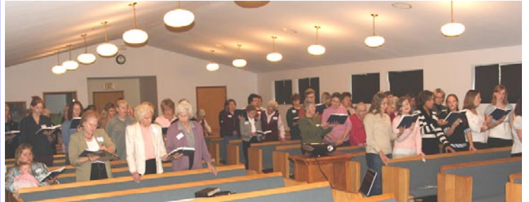
Women's Mission Conference at Lynden, Washington