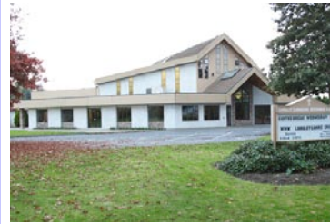
Canadian Reformed Church, Langley, BC