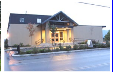
Immanuel Covenant Reformed Church, Abbotsford, BC (URCNA)