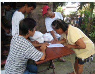
Detailed accounting and record keeping so everyone honest.

A high priority is translating the Good News Bible Study into Tagalog, the Philippine language and setting up both printed and on-line courses to begin a national effort to establish churches. First the translation and then some infrastructure is needed.