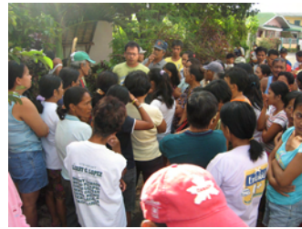
Instructions and prayer before distribution.

aid to churches without creating dependence. The project was well handled. While the floodwaters slowly subside, he continues with Bible studies to many who received aid.