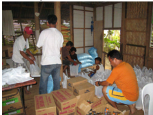
Aid distribution preparations by church members.

Finally, this year when another flood and typhoon struck, the Lord compelled us to move with some assistance. Through God's grace, He provided us with over $3000 to send to their aid which brought aid to over 700 families. We were aware of their background in deaconal aid projects with their former denomination and saw how well organized they were. He shares our philosophy of